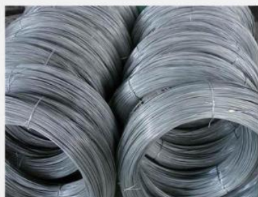
Stainless steel cold drawn wire is widely used in construction, industry, chemical products, etc.